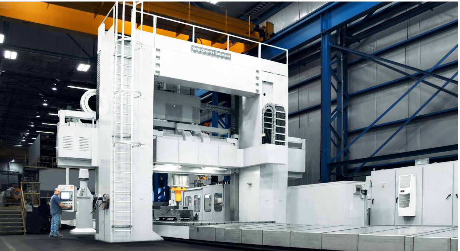
WaldrichSiegen portal mill modernized by KPM in Ford City