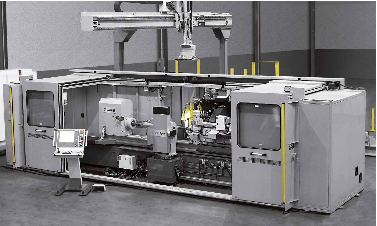
Custom Herkules roll machining center with automated loading made in the USA