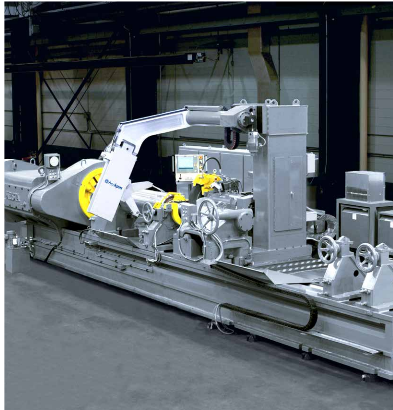
Rebuild of a Mesta grinding machine with reliable roll inspection technologies from HCC/KPM