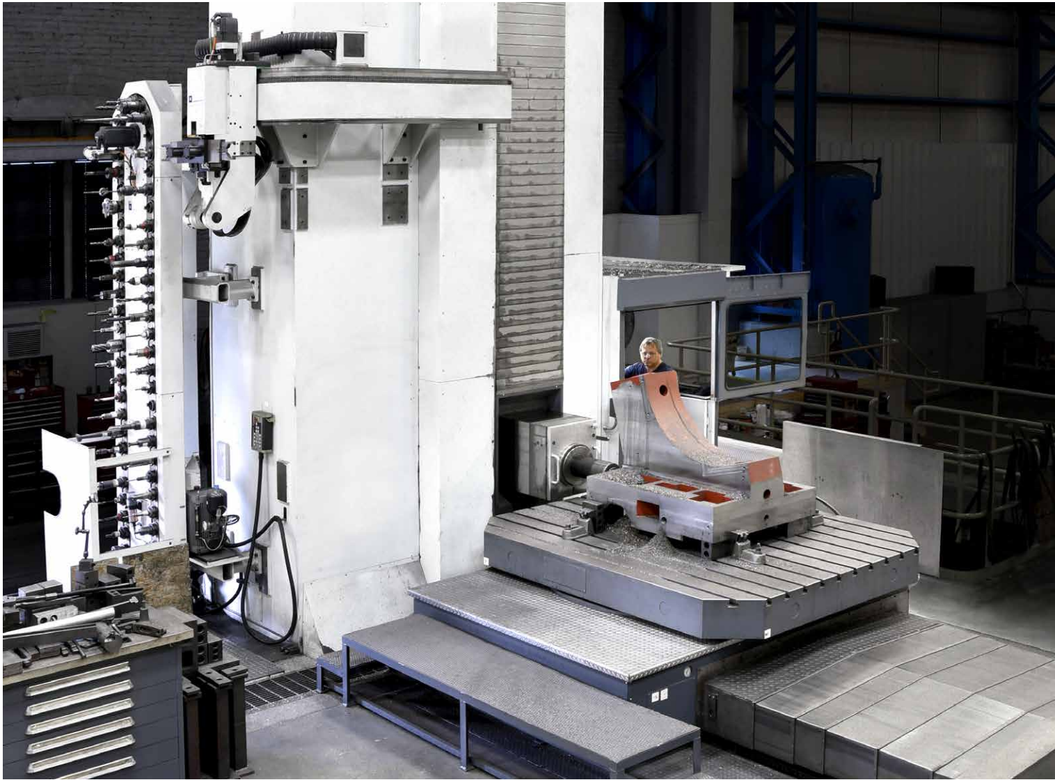
Union PCR 160: Horizontal boring mill with fully hydrostatic guidance system